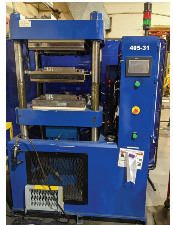
NEW CONVERTED RCM MOLDING PRESS

the press, eliminated the need for all the buttons and switches on the front of the machine. We also ordered a new Rubber Preforming machine from VMI-AZ to replace our aging and problematic preforming machine. The pandemic apparently had a play in this machine taking so long to get here, along with the Holiday season in Germany (which seemed to last 6 months) and always-new complications with certain components or transportation problems, record snowfall and cold temps. The new Shark 90 should arrive shortly after Easter. It will have a higher capacity, which will enable us to make larger preforms more accurately and slightly faster than the current method.