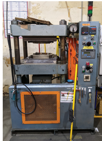
OLD RCM MOLDING PRESS

Over the past year we have been increasing our molding room capacity. We added a 4-cavity press, which was purchased from E-bay and needed some electrical and hydraulic updates. We also converted two other presses into dual cavity presses -- this means each press can mold two large pads at the same time or use any combination of molds. We have plans to convert yet another press to a dual-cavity press in the near future. The old press controls were complicated and becoming obsolete, so we now have new touch screen controllers that can control every function on